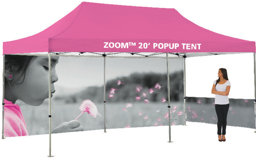
Standard Canopy, Fullwall & Halfwall Stock Colors

The Zoom™ Tent is great for outdoor fairs, exhibitions, sporting events and arenas, concerts, festivals and more. Strong, solid, stable, wind-resistant & durable. Graphics are long-lasting and can endure exposure to outdoor elements. Polyester canopies and sidewalls are water resistant and UV-resistant, providing the ultimate protection from the sun.